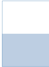
1/2 page landscape 210 x 148 mm (width x height) €11,564